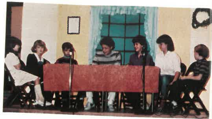
Homeschool Play 1985