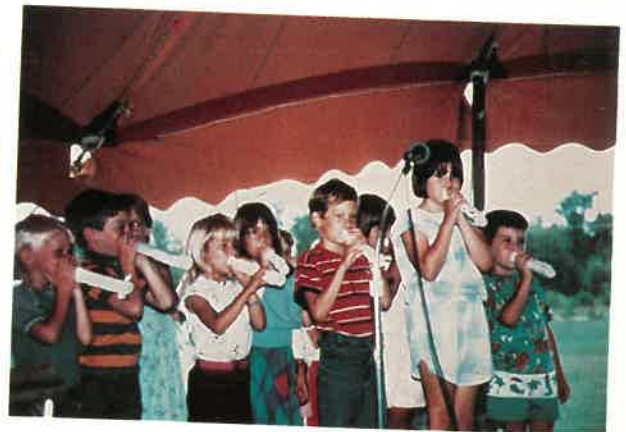
VBS under the Big Top