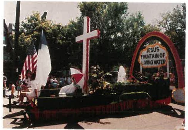
Parade Float 1988