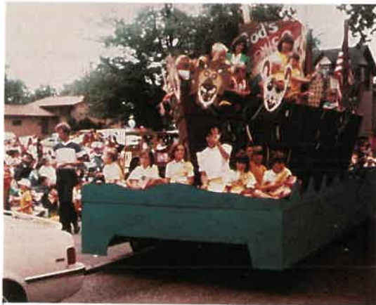
Parade Float 1986