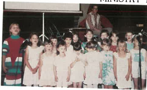
The Children's Choir