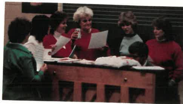
Women's Choral Practice