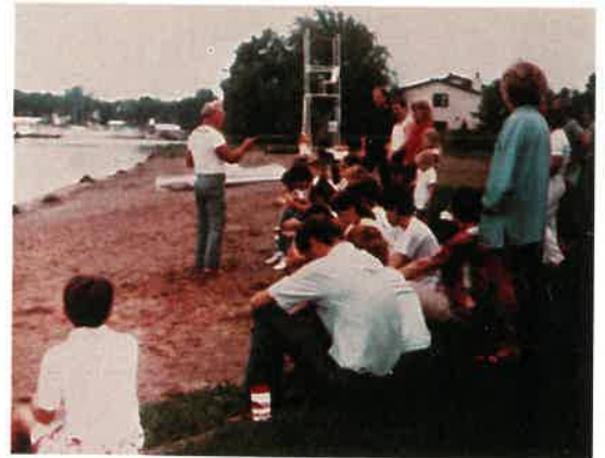
Water Baptism at Lakeside Park