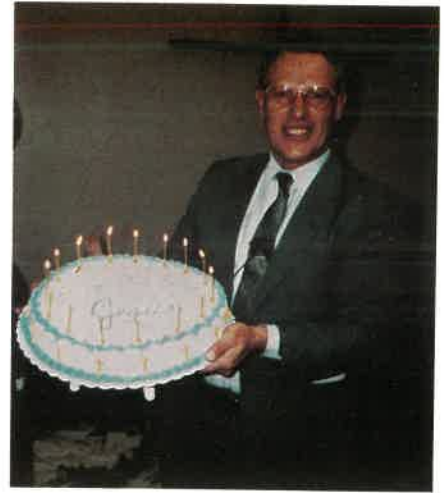
Jesus Birthday Party