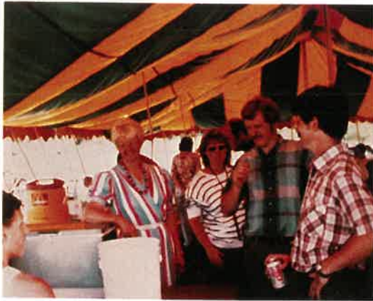
Church Picnic under the tent