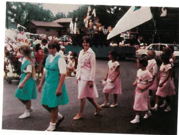
Missionettes in Action