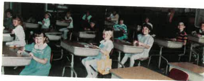
Sunday School in Session