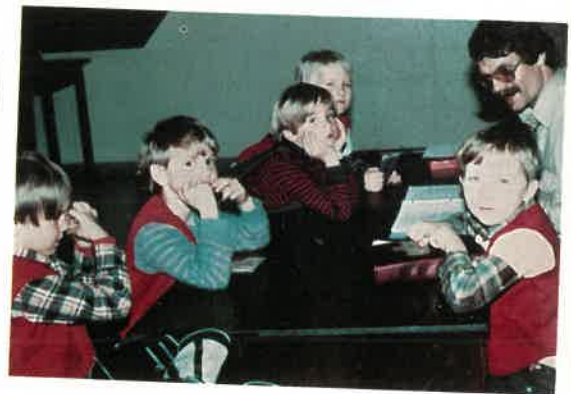
Royal Rangers Hard at work