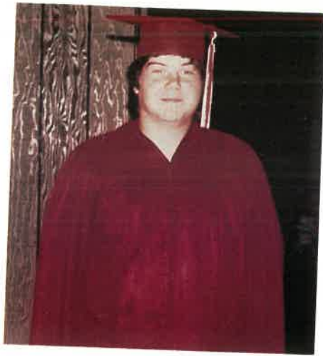
1st Homeschool graduate